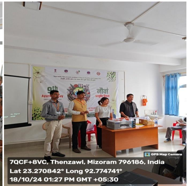
7QCF+8VC, Thenzawl, Mizoram 796186, India Lat 23.270842° Long 92.774741° 18/10/24 01:27 PM GMT +05:30