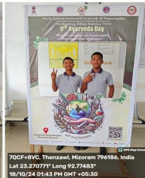
Demonstration of I Support Ayurveda Campaign for Peoples at Integrated AYUSH Hospital, Thenzawl On 18/10/2024