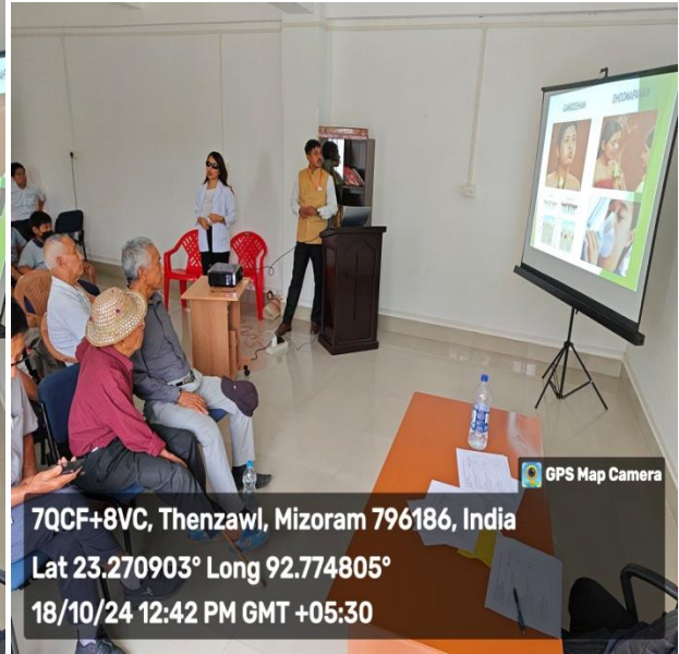
7QCF+8VC, Thenzawl, Mizoram 796186, India Lat 23.270903° Long 92.774805° 18/10/24 12:42 PM GMT +05:30