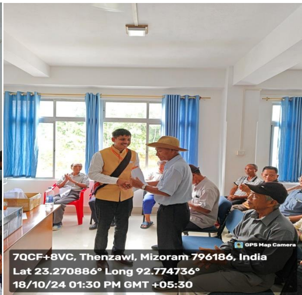
Awareness & Sensitization Lecture on Ayurveda on Ayurveda Principle of Wellness for AYUSH Professionals at Integrated AYUSH Hospital, Thenzawl 18/10/2024