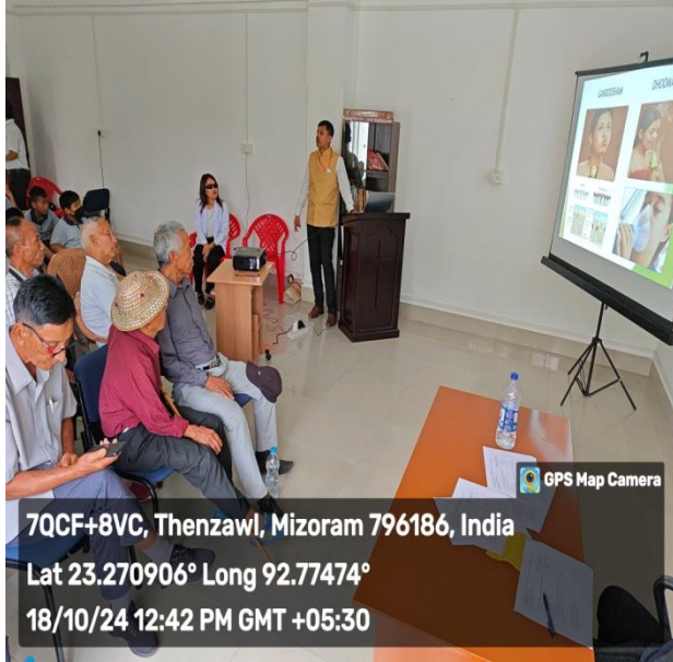
7QCF+8VC, Thenzawl, Mizoram 796186, India Lat 23.270906° Long 92.77474° 18/10/24 12:42 PM GMT +05:30