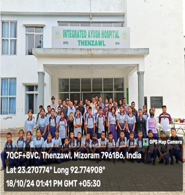
Distribution of medicinal plants to the Patients & Students at Integrated AYUSH Hospital, Thenzawl on 18/10/2024