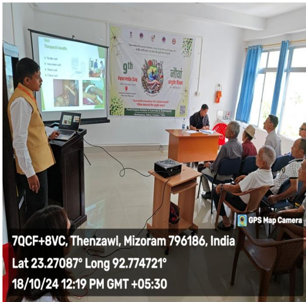
7QCF+8VC, Thenzawl, Mizoram 796186, India Lat 23.27087° Long 92.774721° 18/10/24 12:19 PM GMT +05:30